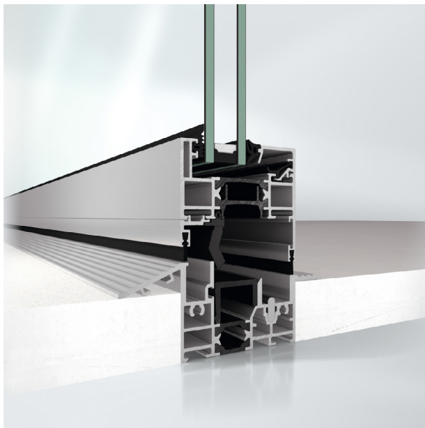
Schüco Folding Sliding System AS FD 75 with 9/16" (15 mm) threshold