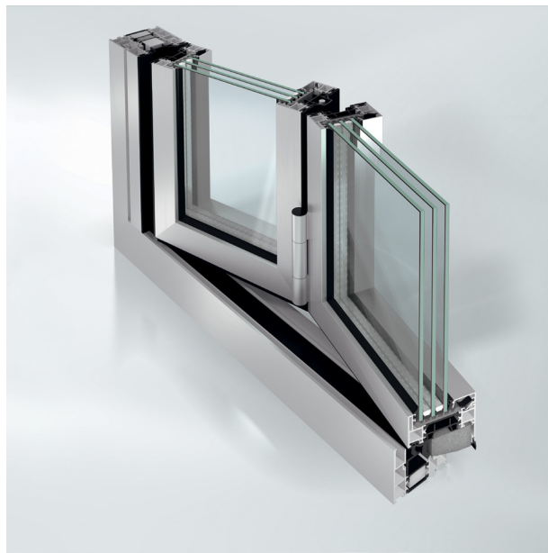
Schüco Folding Sliding System AS FD 90.HI

The new Schüco AS FD 75/AS FD 90.HI is a sleek folding sliding system that effortlessly connects interior and exterior spaces. Its slim profiles and large foldable glass panels provide maximum transparency and space-saving functionality, offering a seamless transition between indoors and outdoors with maximum opening widths.